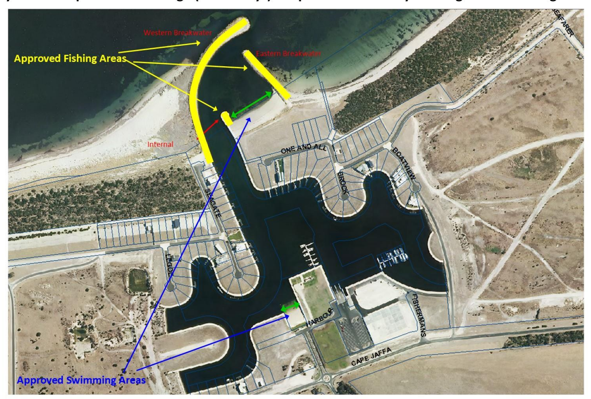
By-law 6 - Cape Jaffa Anchorage (Waterways) - Cape Jaffa Waterways Fishing and Swimming Areas